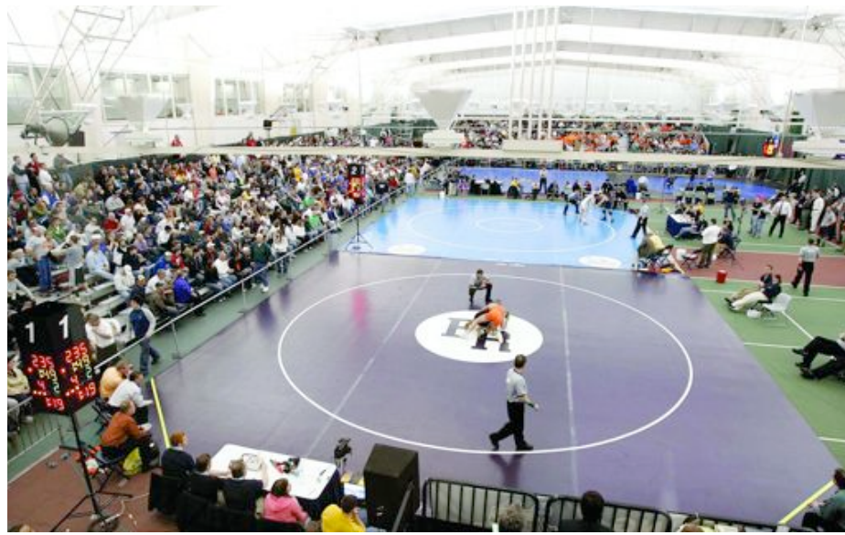
TCNJ's recreation center during the 2006 NCAA Wrestling Championship