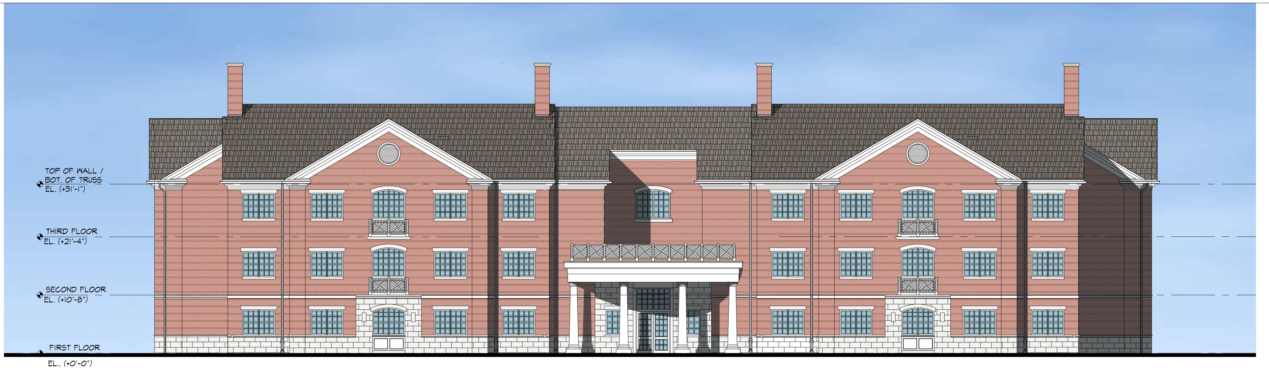
1 EAST ELEVATION 1/8" = 1'-0"