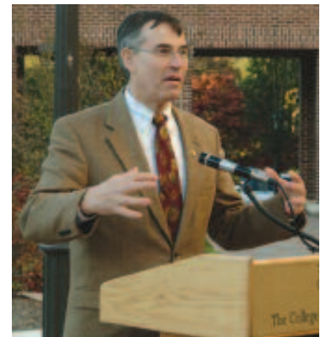
12th District Congressman Rush Holt gave the keynote address about the need to strengthen science education in America at the dedication ceremony for the new Science Complex on October 28.