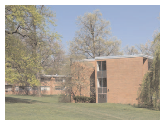
construction photos © George Moore Photograp