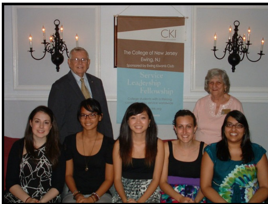
TCNJ Circle K members receive new banner, donated by the Kiwanis Club of Ewing, NJ.

During the meeting we were presented with our new banner, which was funded through the generosity of our parent organization. We have been proudly displaying it at every meeting as well as all of our community events, and we plan to continue to do so in the future.