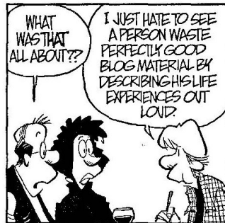
Zits and all associated characters © 2006 Zits Partnership.